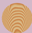
Art Board / Canvas