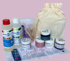
Resin Art Gift Pack